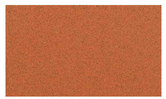
Red Brick Y4316N