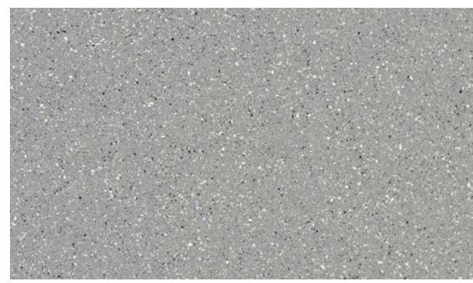
Light Grey Natural Concrete