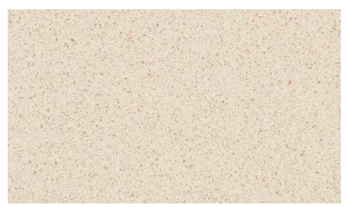
Portland Stone Y4312N