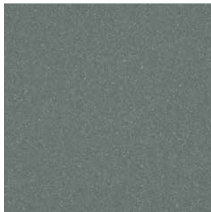
Y2375V / Y2375N

Colors and trends for the world's finest creative minds