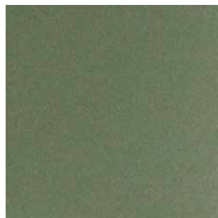
Y221DV / Y221DN