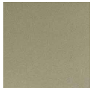
Y220RV / Y220RN