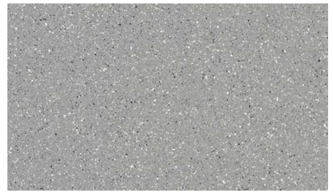
Light Gray Natural Concrete YX317QF