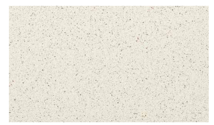
White Stone YX318QF