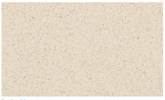
Portland Stone YX319QF