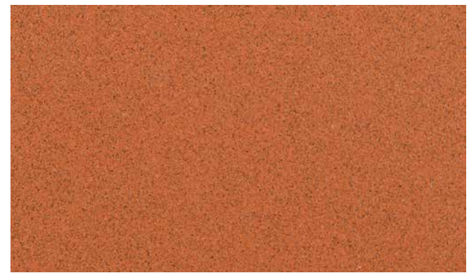
Red Brick YX316QF