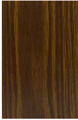
Mocha Oak YZ322QF / 99158-202*