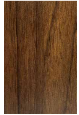
Mocha Walnut YZ322QF / 99007-205*