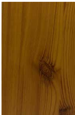
Saffron Pine YZ321QF / 99403-201*