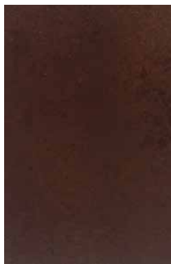
Sanger Base Coat YZ323QF