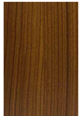
Saffron Pecan YZ321QF / 99061-201*