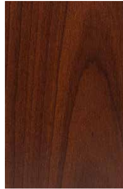
Pelle Cherry YZ324QF / 99061-219*