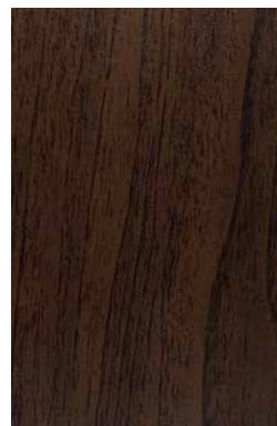
Sanger Walnut YZ323QF / 9V001-150*