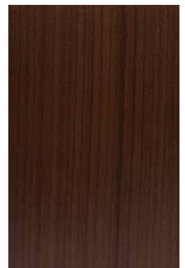
Sanger Cherry YZ323QF / 99061-219