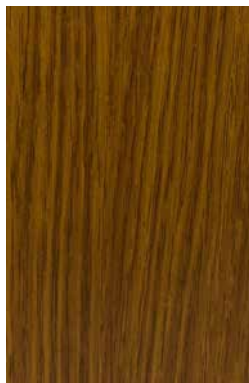
Saffron Oak YZ321QF / 99090-218*