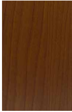
Mocha Teak YZ322QF / 99020-201*