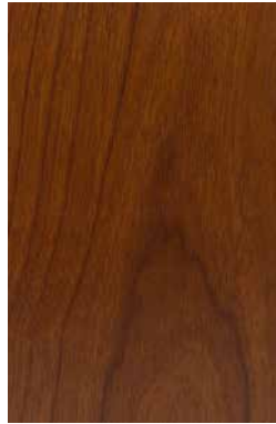
Pelle Teak YZ324QF / 99020-201*