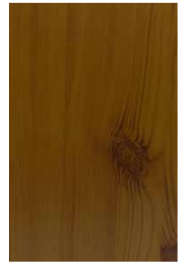
Mocha Pine YZ322QF / 99403-201*