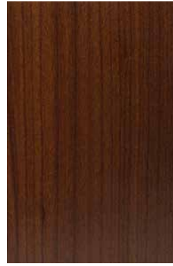
Mocha Cherry YZ322QF / 99061-219*