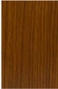
Pelle Oak YZ324QF / 99090-218*