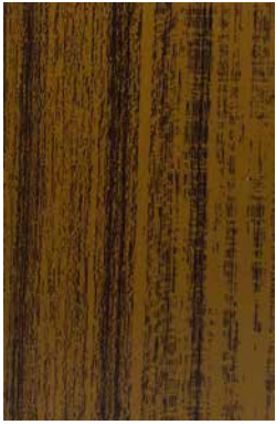
Mocha Eucalyptus YZ322QF / 9V008-150*