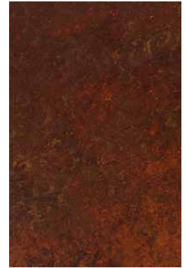
Pelle Corten YZ324QF / 93068-202*